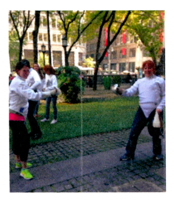
n 2010 we spent a lot of time fighting for what we believe in and defending our rights.